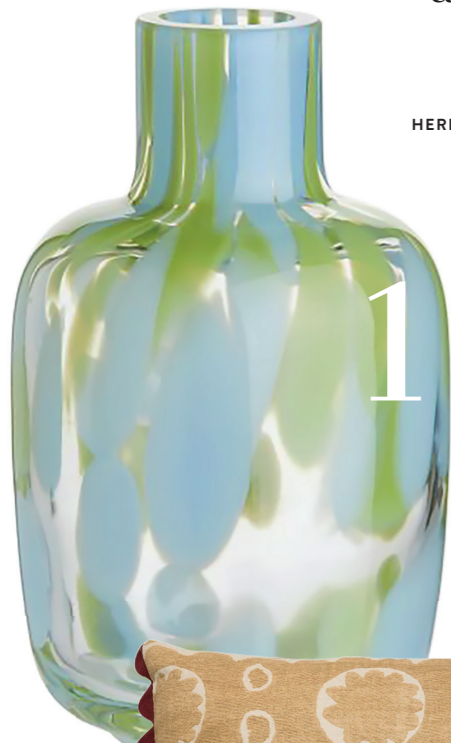
1 Confetti Vase £17