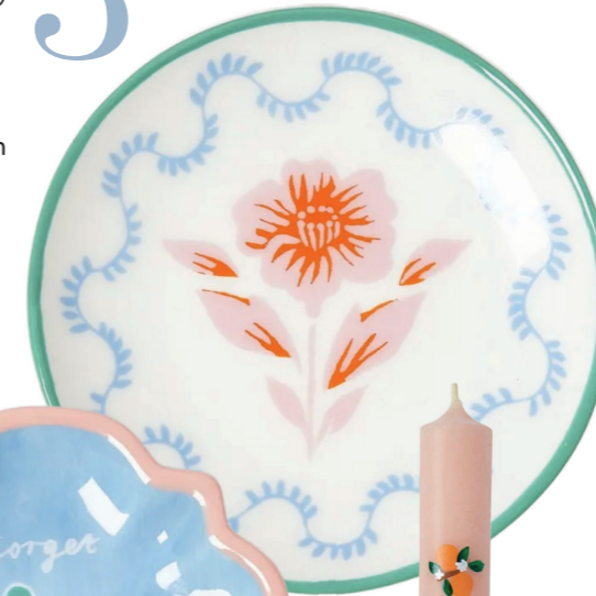
7 Orange Blossom Handpainted Candle £20

Add interest to your styled tables, mantle and dressers with handpainted candles in fresh, zesty patterns. www.bableyourtable.com