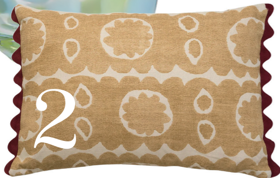
2 Osborne Yellow Cushion £120

Beautifully patterned glass in soft spring tones adds freshness to spaces, with delicate pops of colour. www.arket.com