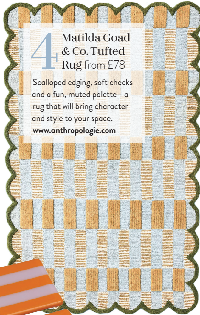
4 Matilda Goad & Co. Tufted Rug from £78

Scalloped edging, soft checks and a fun, muted palette - a rug that will bring character and style to your space. www.anthropologie.com