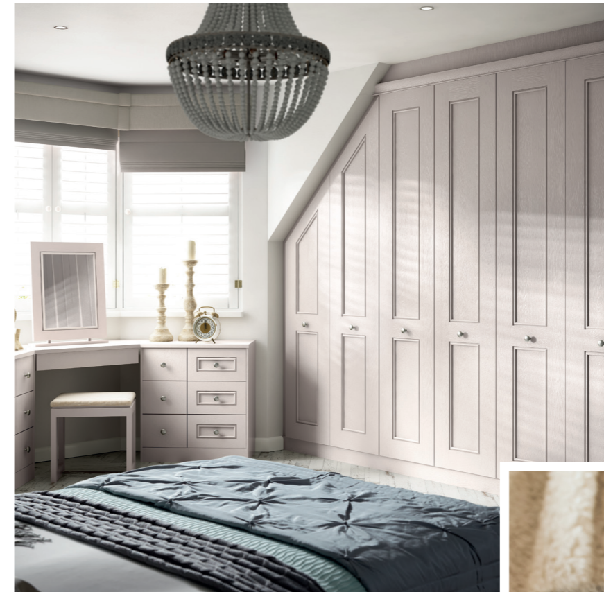
Harpsden in Light Praline

The only down side? Experts say we should keep pets out of the bedroom to reduce sleep disturbances (let’s pretend we didn’t say that). ■