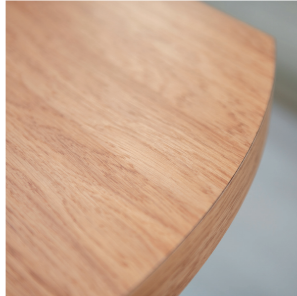
Real Wood Work Surface with Curved End