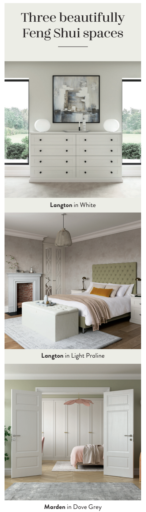
Three beautifully Feng Shui spaces