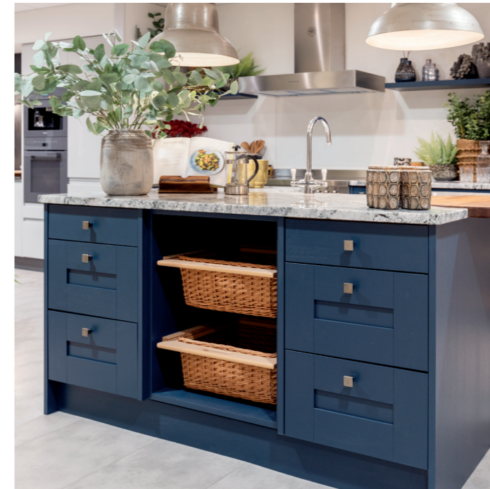
Highbury in Cobalt

“There's a real wow factor to the store now as customers step inside”