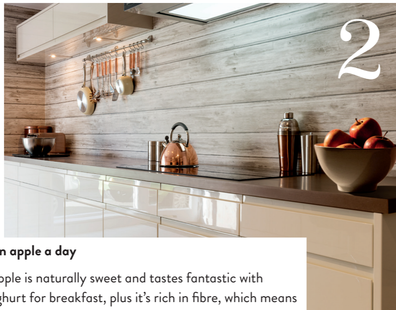
Liverton in Limestone

has worked with David Beckham, Benedict Cumberbatch and Jamie Oliver, and is founder of nourishbyjaneclarke.com