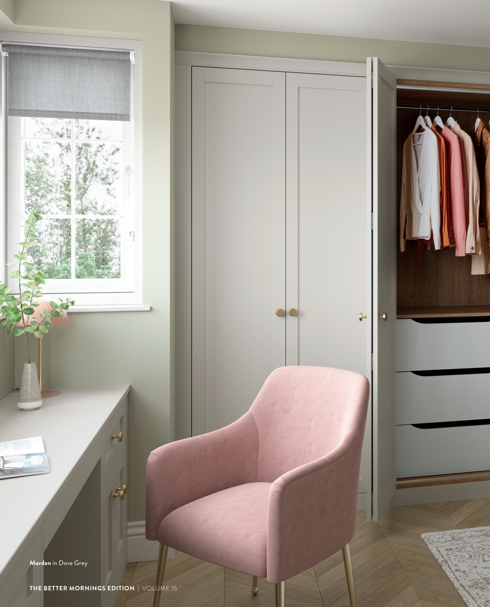
Marden in Dove Grey