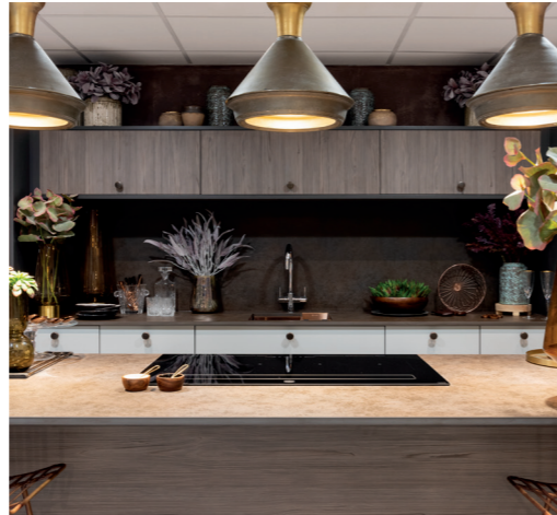
Loxley in Ash Grey, Smoke House Grey & Rustic Grey Oak

It makes such a difference to be able to walk around a room set and imagine how the furniture might look in your own home. I've worked for Hammonds for seven years and what sets us apart is that we combine practical storage solutions with eye-catching design. At the moment, it's our brand new, cobalt blue Highbury kitchen that's getting all the attention. Customers love it! ■