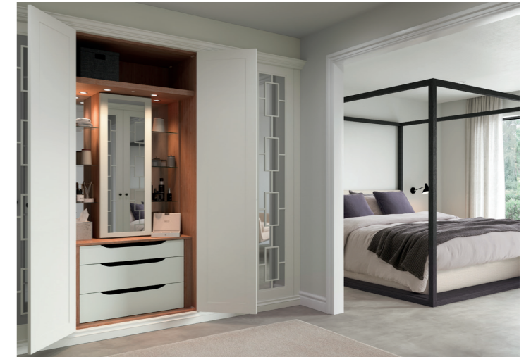
NEW Langton in White