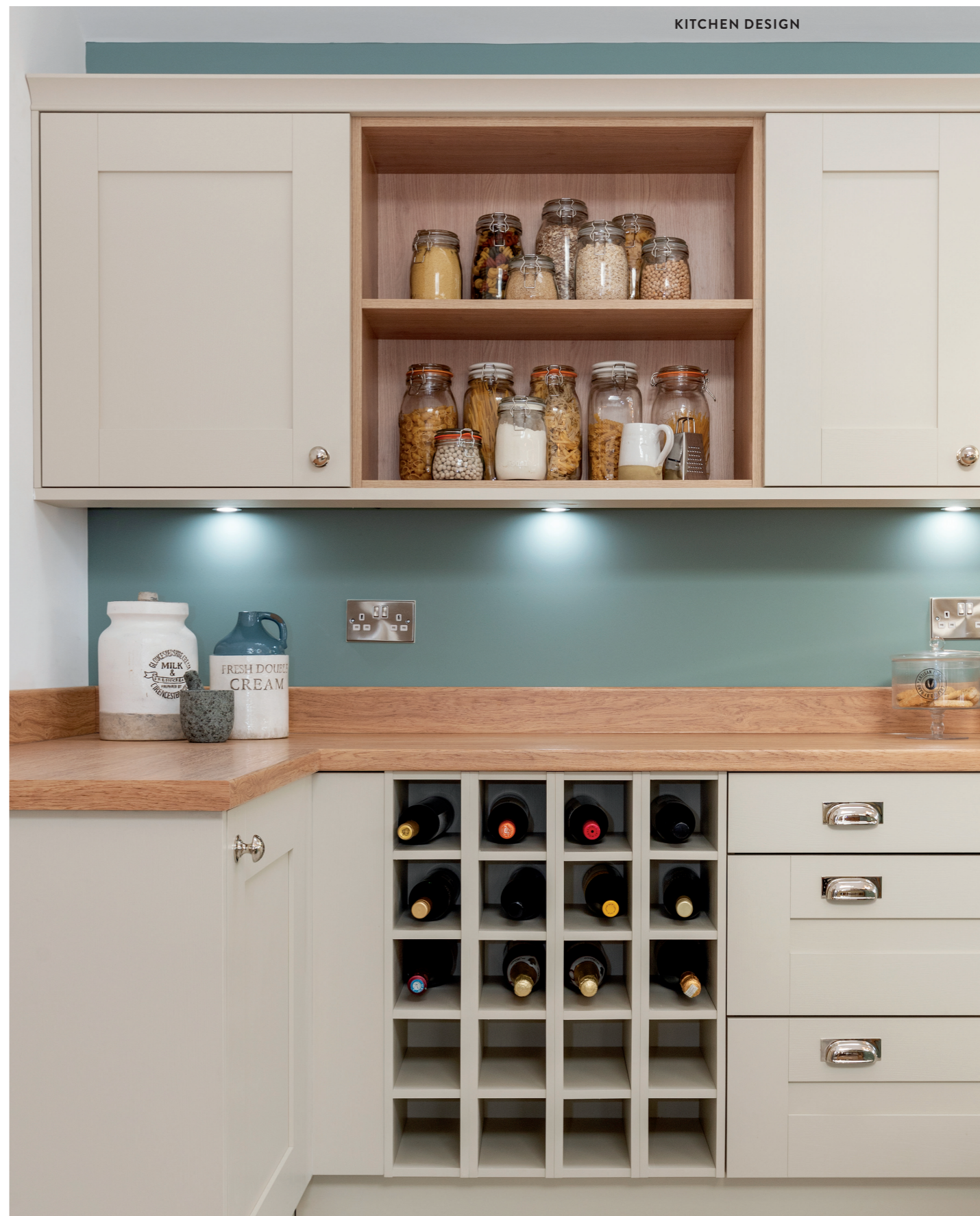
Highbury in Mussel

'What really sets this kitchen apart though is that it's full of character,' says Keeshak. 'Often customers can fall into the symmetry trap – they want everything to be identical and match across the kitchen. As designers, we can show that having a curved end to the island, or balancing a plate rack on one side of the central point (here, that's the tall larder cupboard and ovens) with open shelving on the other, brings balance without looking stiff.' It's all about creating a kitchen that feels like a member of the family... ►