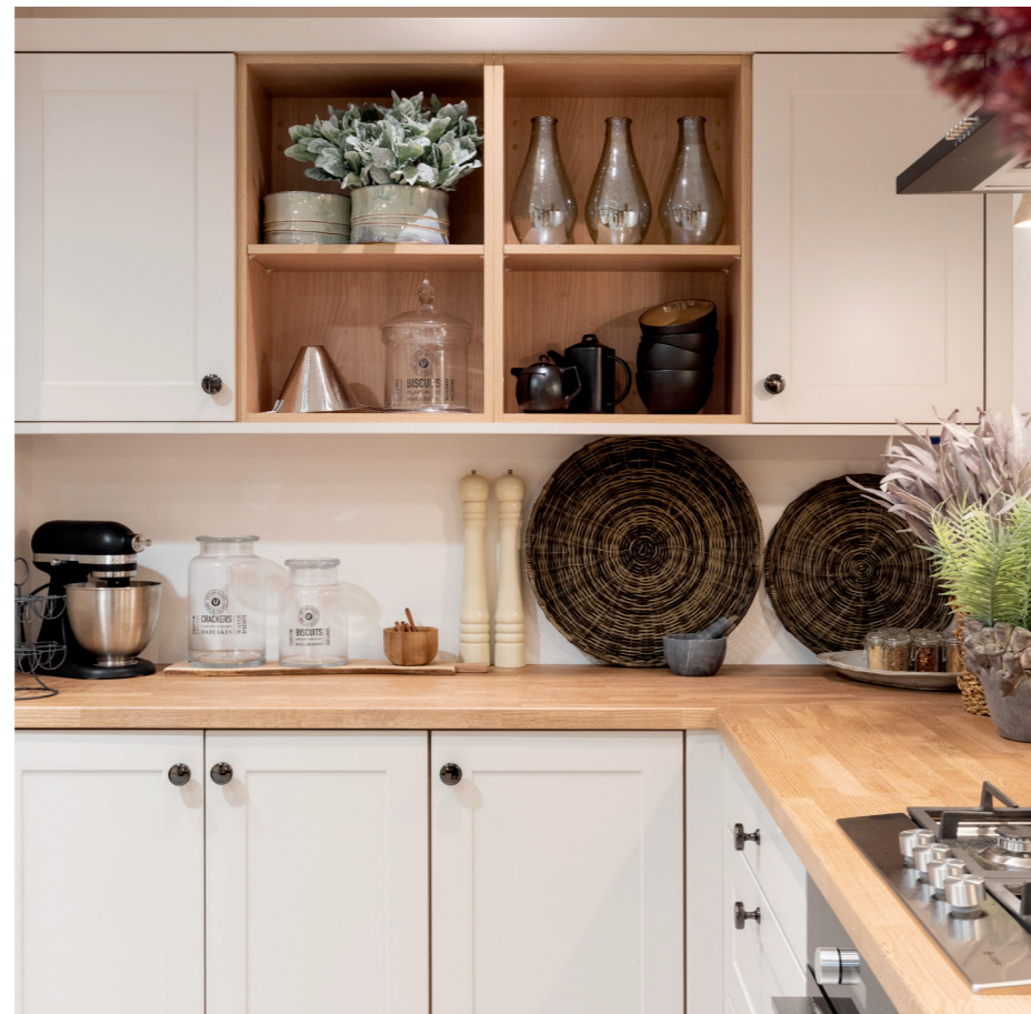
Abbey in Cashmere