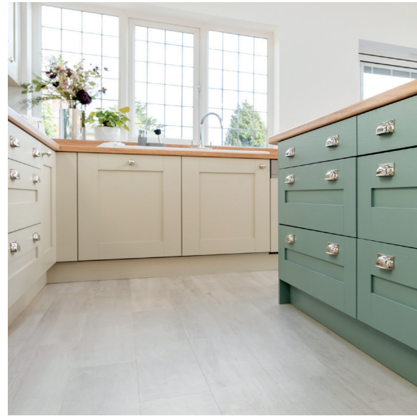
Highbury in Mussel and Boat House