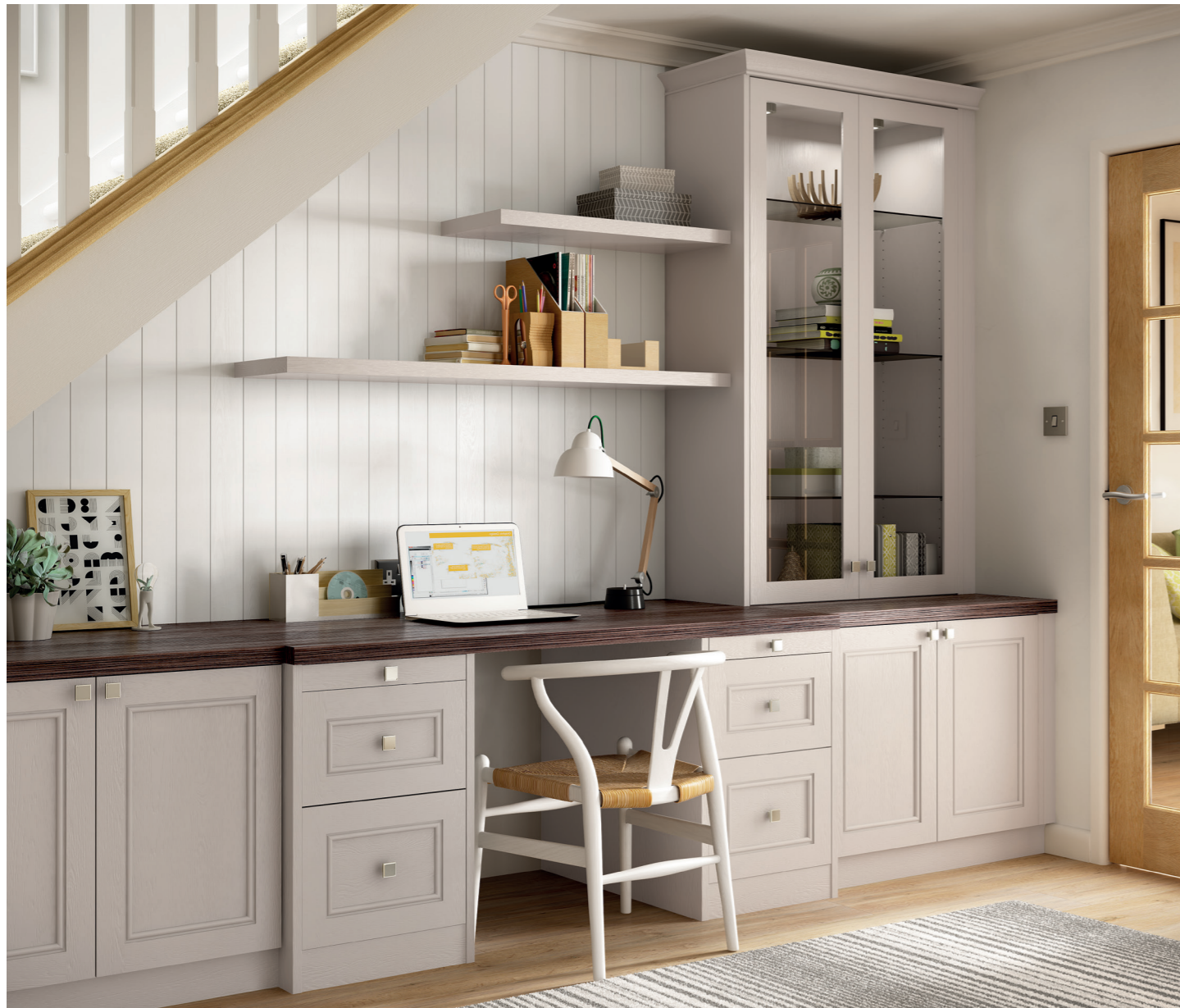
Harpsden in Light Praline