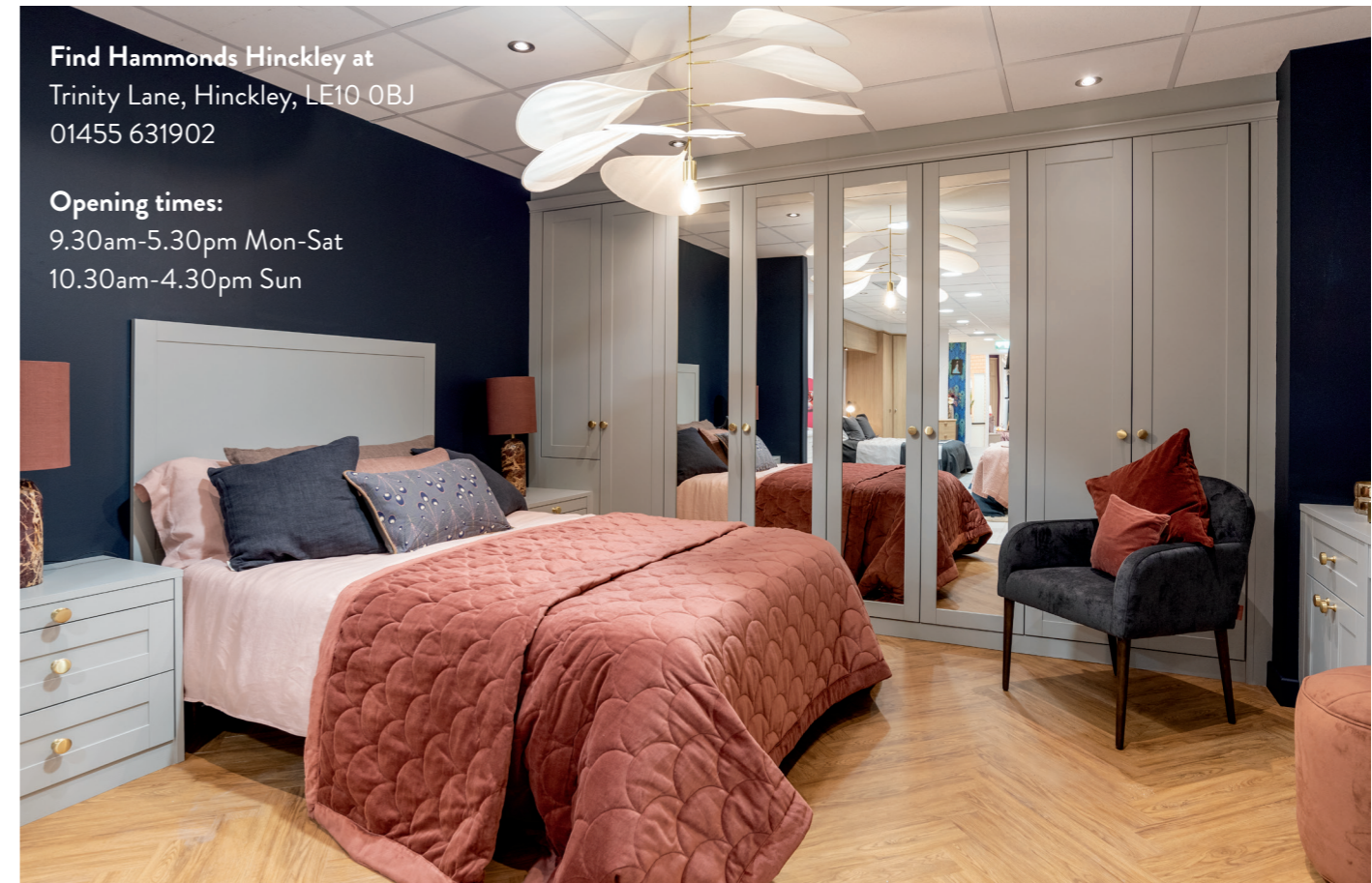
Marden in Pebble Grey

Find Hammonds Hinckley at Trinity Lane, Hinckley, LE10 0BJ 01455 631902