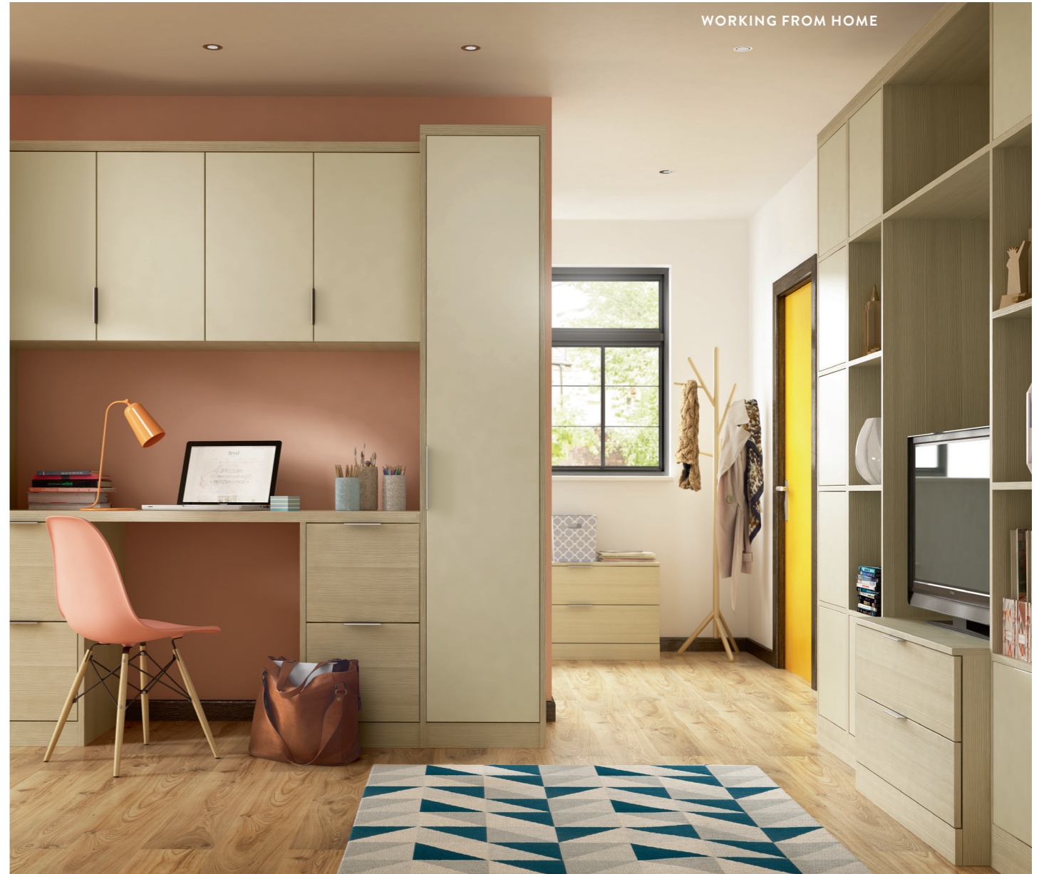
Vigo in Light Pine & Vanilla Matt

to make room for a desk, cupboards and shelves for all your essential work kit. Our unique home office furniture comes with a selection of ready-made storage solutions, or can be custom made to suit your space. And because each of our hardworking ranges spans bedroom and kitchen furniture, too, you can coordinate your home office set-up with the rest of your room, for a smart finish. What a result... ►