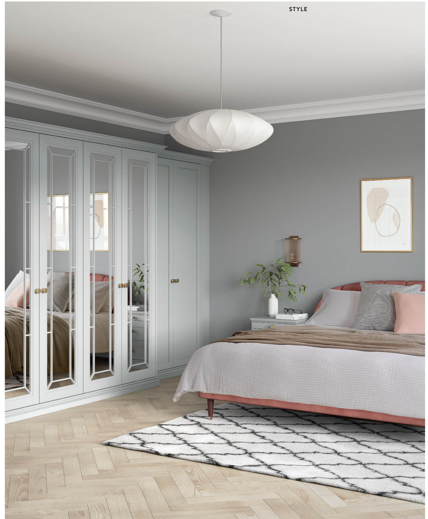
Langton in Pebble Grey